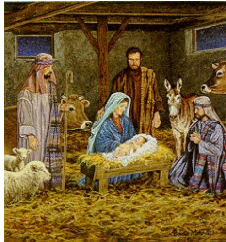
JESUS CALLING By Sarah Young

Let us pray: Heavenly Father above, at this time may we all again thank You, praise You and bless You Lord for the birth of Your Son and our Savior, Jesus Christ. Lord, if we get caught up in all the splendor of the season's festivities, Father help us to remember this Christmas, the real reason for the birth of Jesus. Lord, I asked this in Jesus name...Amen.